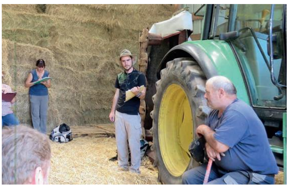
Figure 1 Advisory visit to a breeder