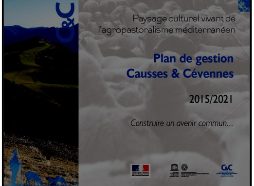
Illustration 2: Management plan

In accordance with UNESCO guidelines that encourage party States to ensure the participation of a wide variety of actors, site managers, local and regional authorities, local communities, non-governmental organisations (NGOs), other stakeholders and interested partners, a specific governance for the management of this site has been put in place since 1 July 2012. It is organised