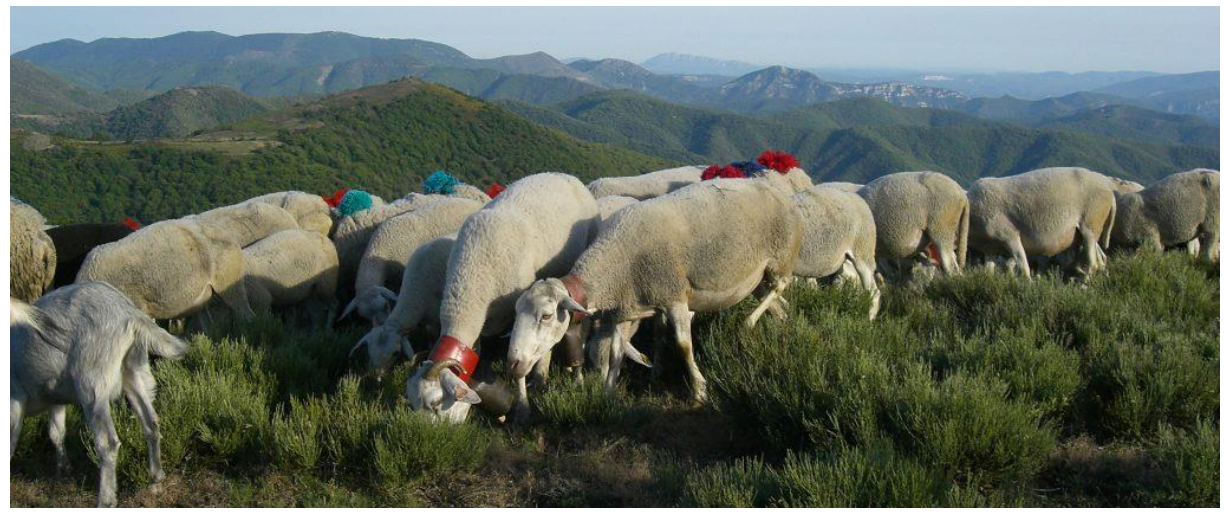
Figure 1 Flocks of sheep gathered on summer pastures