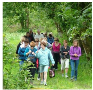
Figure 8 Figure 9

Actors and roles: The Burren Programme Team and Burrenbeo Trust Team have supported many of these value-added initiatives.