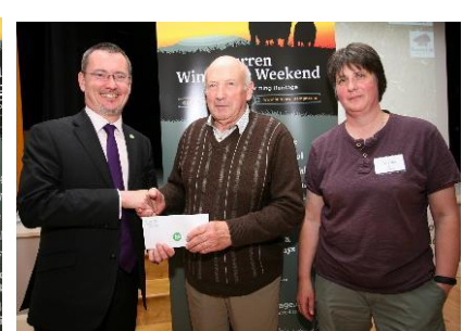
Figure 2 Figure 3 Figure 4