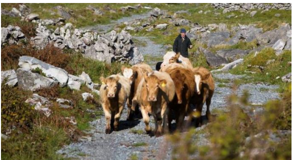
Figure 7 Figure 8

Disclaimer: This document reflects the author's view and the Research Executive Agency is not responsible for any use that may be made of the information it contains.