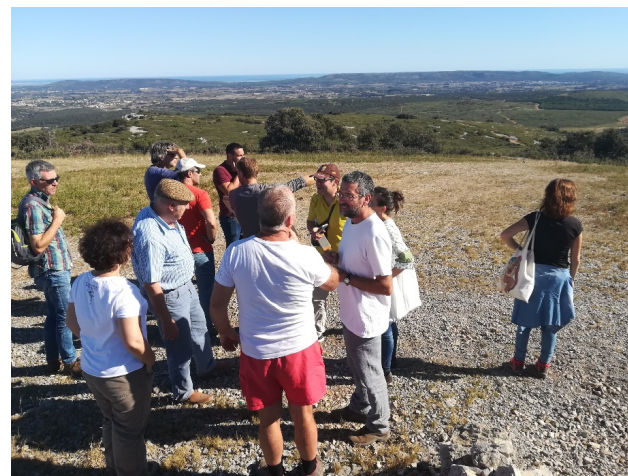
DAY 1: A day of meetings on the theme of pastoralism and fire risk management was proposed to the Spanish delegation (7 participants). Presentations and discussions took place around three pastoral farms on the Aumelas massif. This made it possible to highlight the role of each one, the partnerships in place (between Grouping of local authorities and their technical bodies, Chambers of Agriculture, etc.) and the devices allowing to maintain the open habitats to prevent the fire risks and / or preserve biodiversity in a context of climate change. The stakes then appeared numerous (accessibility of the land, cohabitation between users, natural constraints, evolution of public policies, technical and financial feasibility ...).