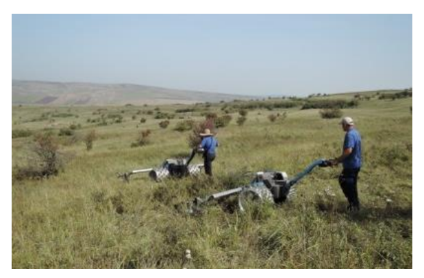
Figure 2 Brielmaier mower.