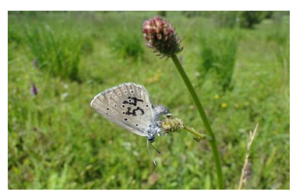
Figure 3 Butterfly Maculinea teleius