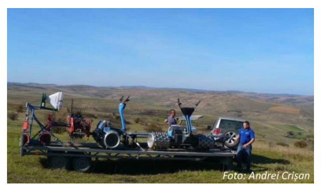
Figure 4 Use of Brielmaier mower in Dealurile Clujului Est