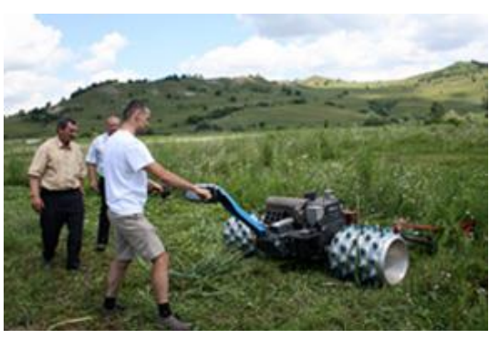
Figure Use of Brielmaier mower in Tarnava Mare

Overall lessons from this example, especially from point of view of HNV farming? The project was a predictable action of SLR to