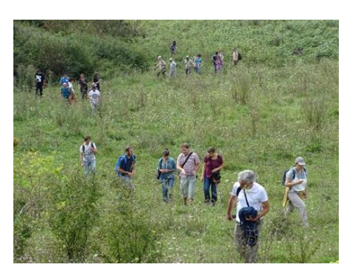
Figure 5 Researchers in the field.

Actors and roles: Romanian Lepidopterological Society (SLR) – initiator/ catalist/innovator ; Romanian Ministry for Education and Research – funding partner; Brielmaier Motormäher GmbH–partner.