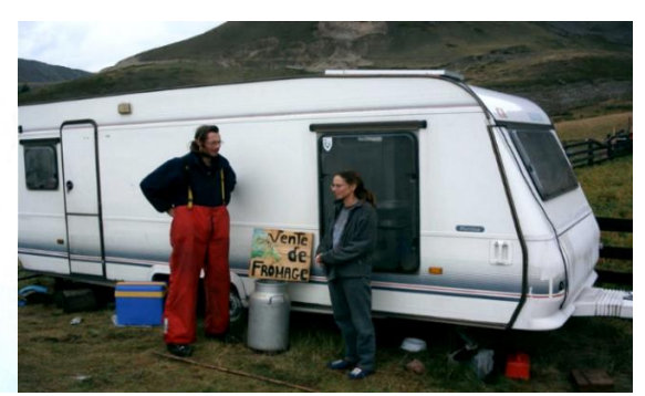
Figure 2 Figure 3