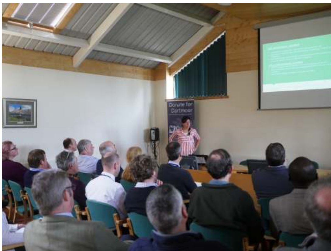
A Defra spokesperson explaining the Government's ambition for a reward system suitable for farmers and other land managers.

The meeting was held at the Dartmoor National Park Authority's offices at Parke, Bovey Tracy, and within the Dartmoor National Park. The event was generously hosted by the Dartmoor National Park Authority (DNPA).